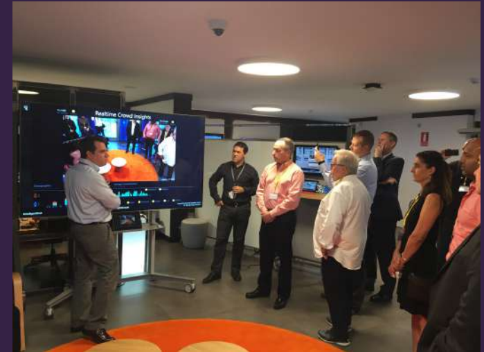
Avanade Innovation Center