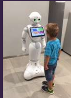
"Pepper" the robot at Health and Well-Being Centre