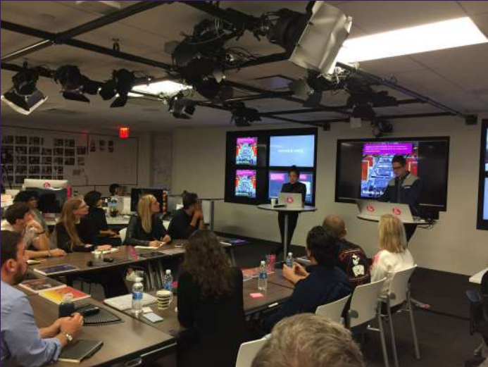
Sparks and Honey trend spotting