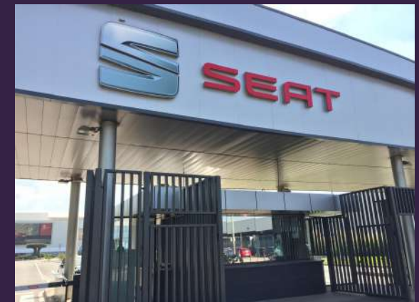
SEAT, connected mobility and urban mobility