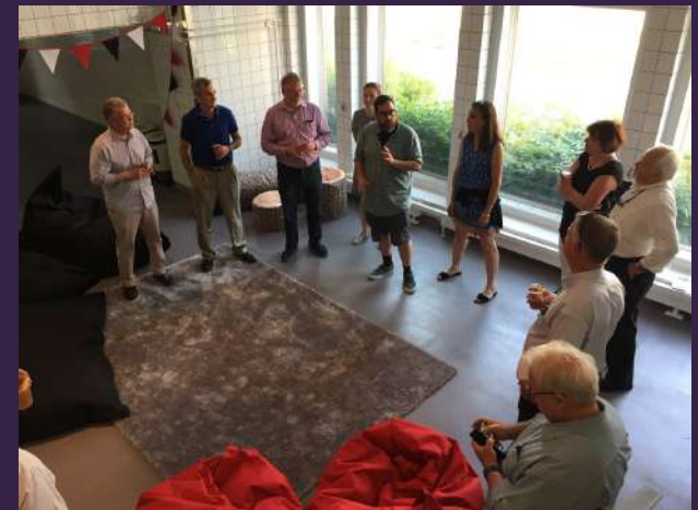
Helsinki Games Factory