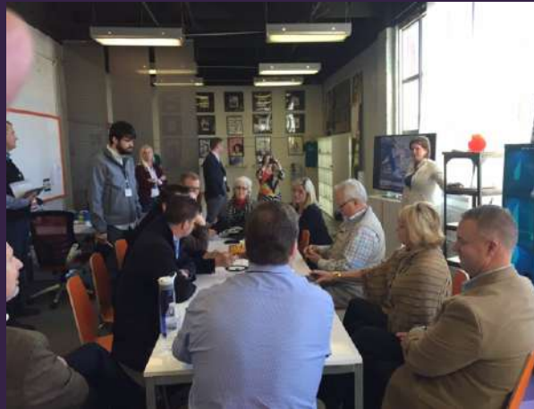
Feetz - 3D Printed Shoes