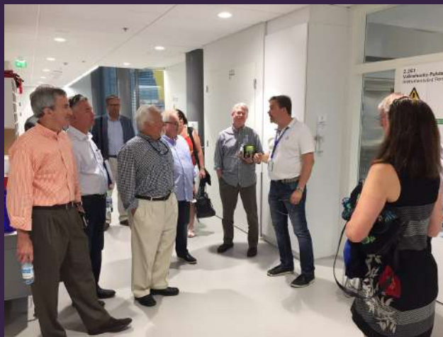
Health and Well-Being Centre