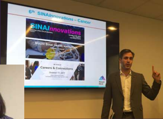
Clinic of the Future, Mount Sinai Health System