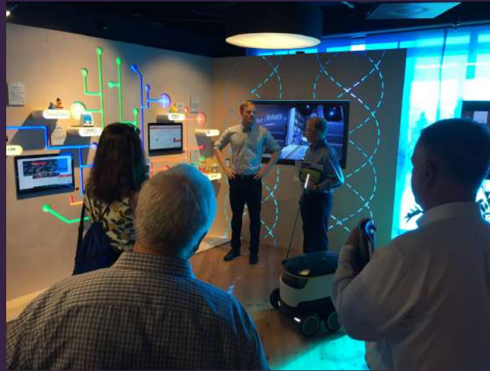
e-Estonia Showroom - We met several innovative companies representing fintech, healthtech, e-residency, cyber security and more