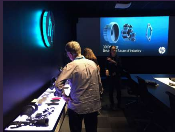
HP 3D Printer Development