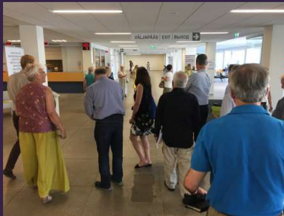
North Estonia Medical Centre