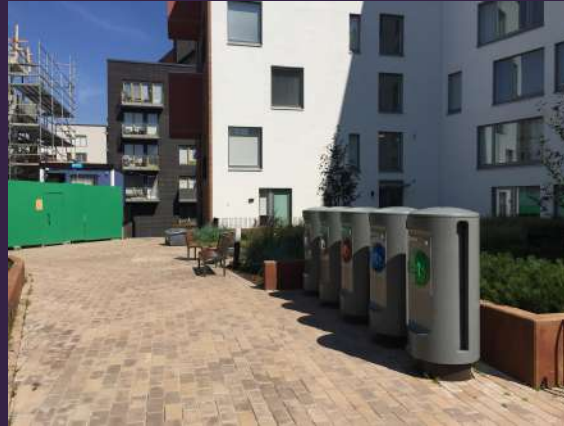
Kalasadama, Smart City