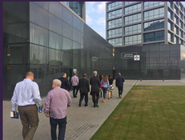
Sant Cugat: Spain's "Smartest City"