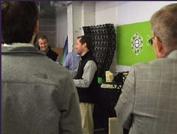
Branch Technologies – 3D Printed Walls