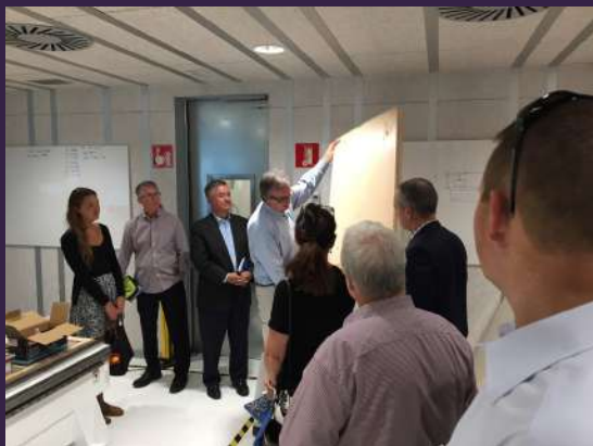
FabLab at ESADECREAPOLIS Tech Collab Hub