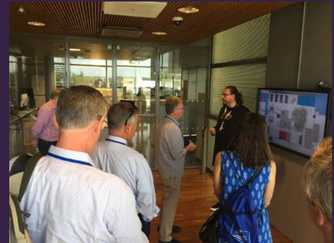
Tieto Empathic Building, former Nokia HQ