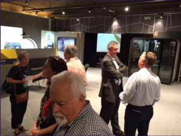
Helsinki Business Hub