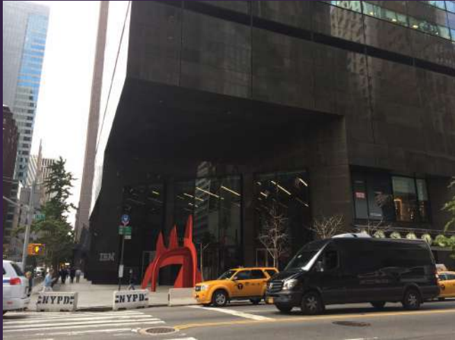
IBM Watson big data analytics