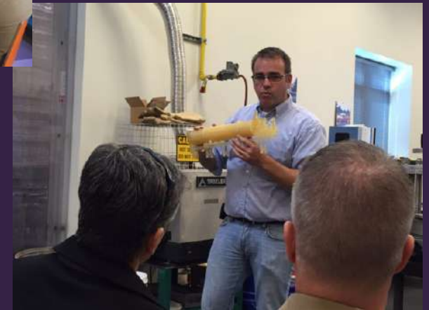
Astec – 3D Printing Burners