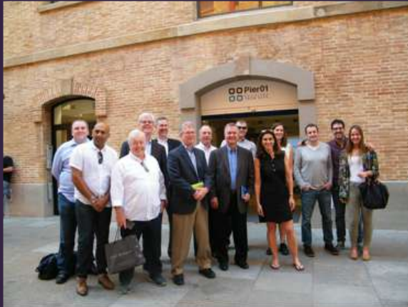
Barcelona Tech City