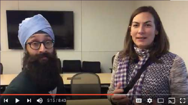
Mount Sinai Health System